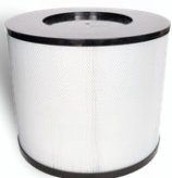
FX Fusion Filter Part number: 20-206-10-008