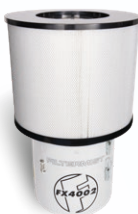
Neat oil solution kit FX4002 Part number: 20-244-30-007