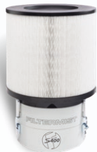
Neat oil solution kit S400 Part number: 20-244-30-000