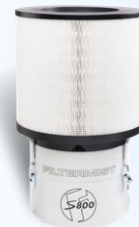
Neat oil solution kit S800 Part number: 20-244-30-001