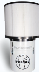
Neat oil solution kit FX5002 Part number: 20-244-30-008