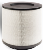
S Fusion Filter Part number: 20-245-30-000